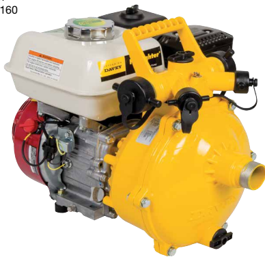
5155H with Honda GX160 Engine

All engines conform to the tough environmental requirements of the USA EPA and CARB standards, to help look after the environment.